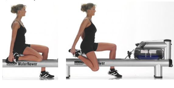
o In a seated position sit tall with shoulders relaxed o Bend one leg bringing the heel towards you